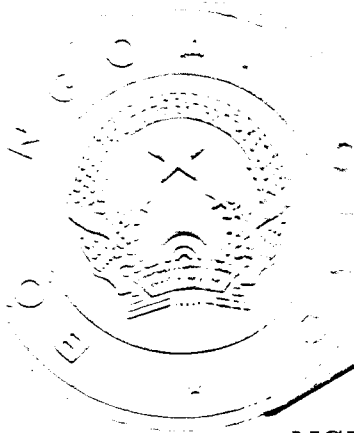
NGUYEN MANH CAM MINISTER OF FOREIGN AFFAIRS

DONE at Hanoi, on the 15 day of November, one thousand nine hundred and ninety nine.