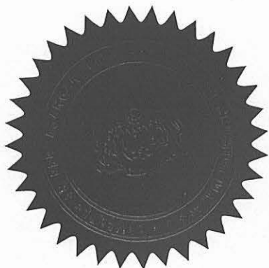
( DATO' SRI MUSTAPA MOHAMED ) Minister of International Trade and Industry Malaysia

DONE at Kuala Lumpur, Malaysia this thirty first day of May in the year Two Thousand and Ten.