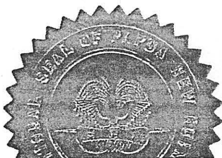
Hon. ANO PALA CMG MP Minister for Foreign Affairs and Immigration

Dated this 26 th day of March Two Thousand and Twelve.