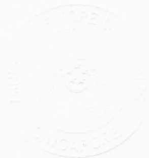
DR VIVIAN BALAKRISHNAN MINISTER FOR FOREIGN AFFAIRS REPUBLIC OF SINGAPORE

IN WITNESS THEREOF , I have signed this Instrument of Ratification at Singapore on the 13 th day of April, in the Year Two Thousand and Eighteen.